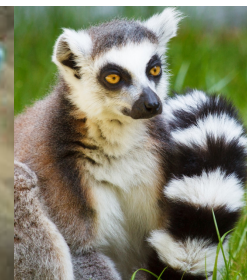
4 coach trips: Brighton, Colchester zoo, Margate, Walton on the Naze