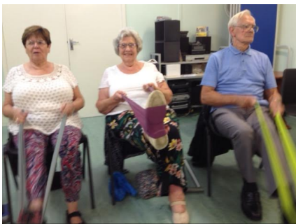
112 chair-based exercises and Street Fit classes