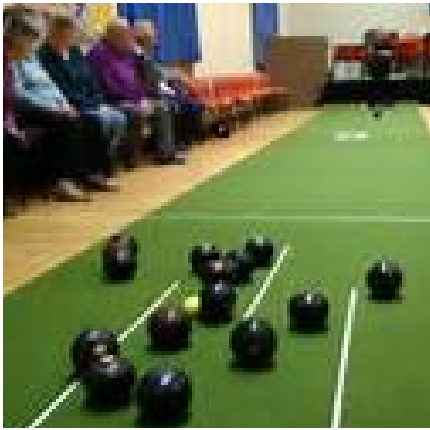
80 bowls sessions