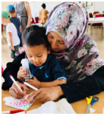
48 homework club, parent & toddler and creche sessions