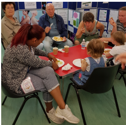
16 events: family fun days, Christmas festivities, Dragon's Den, planting, community consultations, volunteer celebrations