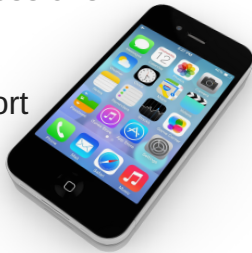
10 IT support sessions