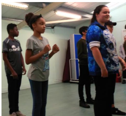
188 days supporting young people with positive lifestyle choices