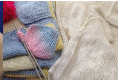
80 knitting & board games sessions